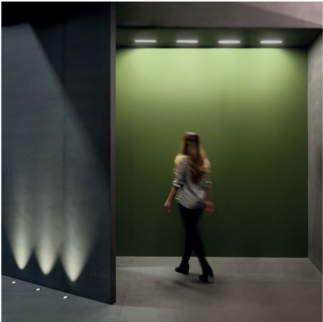
Arkeslight Stand, Light + Building 2018, Frankfurt (Germany) | Design: Francesc Rifé Studio