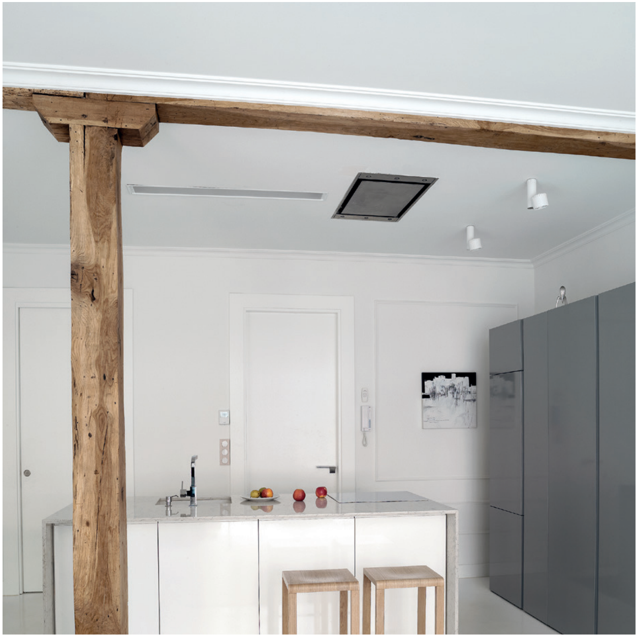
Private residence, San Sebastián (Spain) | Design: Ziako Interiorismo